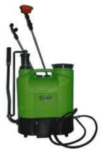
Battery & Hand Operated Sprayer 16 Litre Tank Capacity