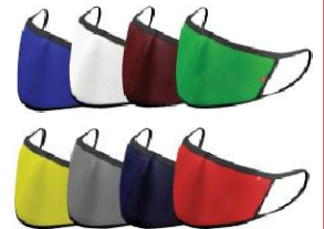
3PLY FABRIC FACE MASK