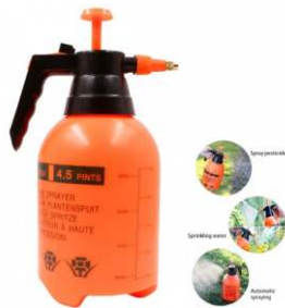
Hand Operated Sprayer 2 Litre Tank Capacity