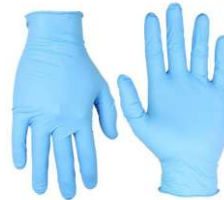
NITRILE HAND GLOVES