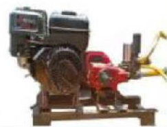
PETROL OPERATED HTP SPRAYER WITH FRAME