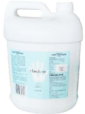
5 Litre pack