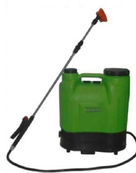
Hand Operated Sprayer 16 Litre Tank Capacity