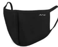
BONDED FACE MASK