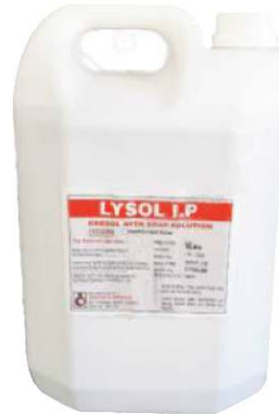
5 Litre pack