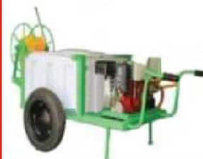
PETROL OPERATED HTP MOBILE SPRAYER

CONTACT US FOR CORPORATE / BULK ORDERS & GET COMPETITIVE PRICES