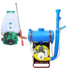
PETROL OPERATED POWER SPRAYER