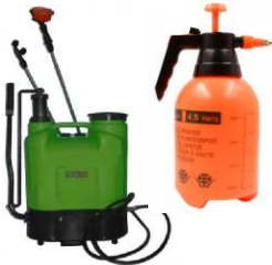
BATTERY & HAND OPERATED SPRAYER