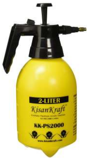
Hand Operated Sprayer 1 Litre Tank Capacity